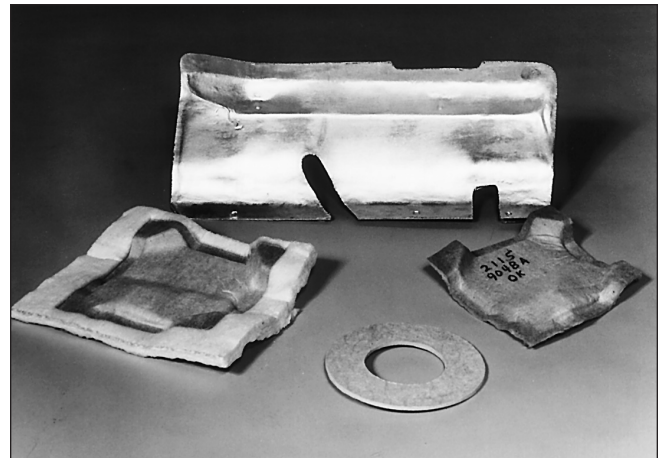
Press-formed parts made from Fiberfrax Duraset felt.

*For availability of nonstandard sizes, contact our Customer Service Department at 716-278-3800.