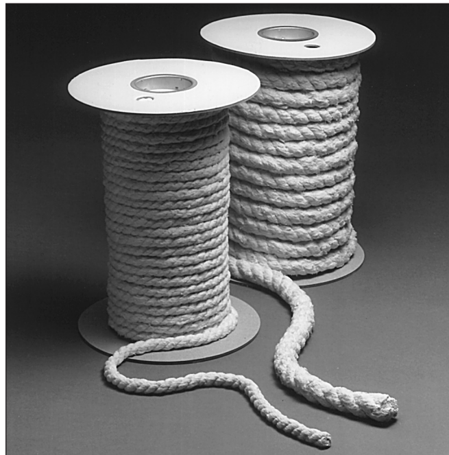
Fiberfrax Rope and HD Rope

Refer to the product Safety Data Sheet (SDS) for recommended work practices and other product safety information.