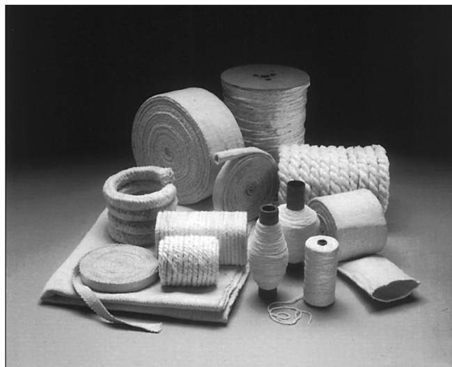
Fiberfrax Woven Textiles Product Family

For additional details on the available woven textile product forms, typical properties and applications for which they are appropriate, refer to Fiberfrax Woven Textiles, Product Information Sheet, Form C-1425.