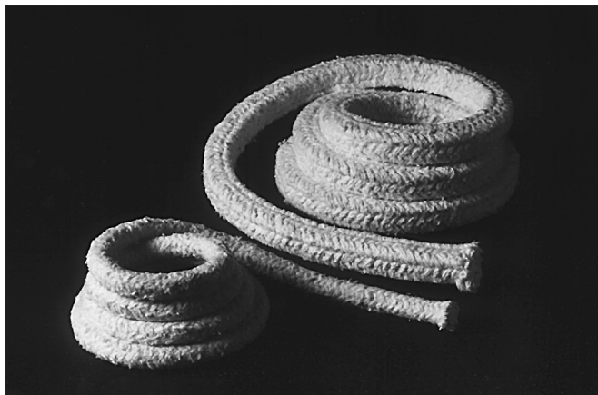
Fiberfrax Round and Square Braid