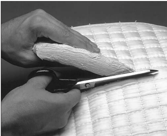
HSA Systems' unique ceramic fiber paper core is free of organics and may easily be cut with an ordinary pair of scissors.

The addition of a textile covering and quilting the composite gives it strength, while at the same time allows the system to remain flexible and formable, providing ease of fabrication. The finished HSA Systems are unaffected by moisture; if the material is wet by water or steam, all thermal and physical properties are restored upon drying. Also, a coating or foil cladding may be added to improve moisture and abrasion resistance.